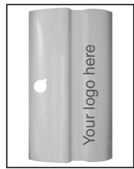
Panels can be customized in dozens of different ways, such as adding your company's logo.