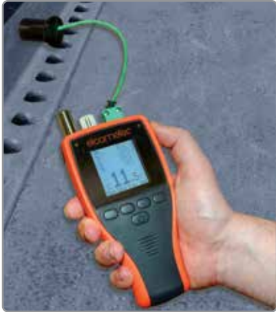
Easy to use with an intuitive menu structure