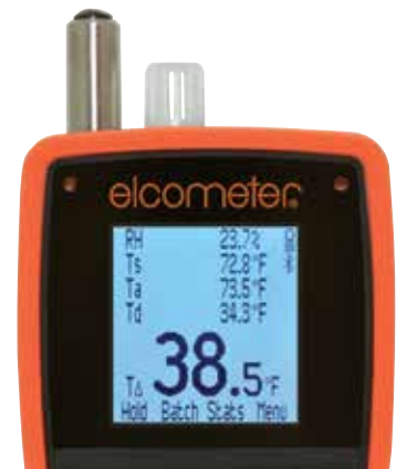
View up to 5 user selectable statistics on screen