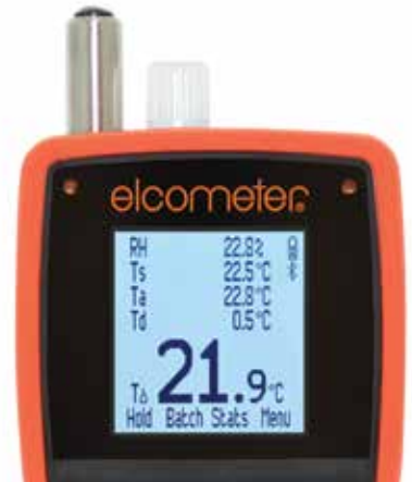
Large easy to read measurements in degrees °C or °F

BS 7079-B4, IMO MSC.215(82), IMO MSC.244(83), ISO 8502-4, US Navy NSI 009-32, US Navy PPI 63101-000