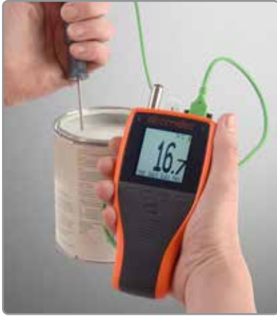
Te - Ideal for use as a simple thermometer