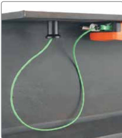
Remote monitoring of climatic parameters