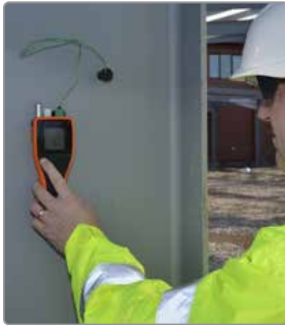
Waterproof and rugged to IP66