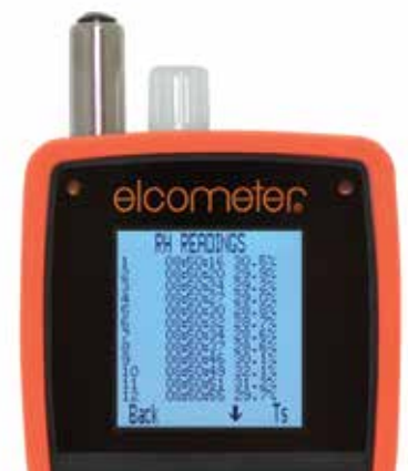
Review individual readings

The Elcometer 319 can be used as either a hand-held dewpoint meter or as a remote data logging monitor. 2