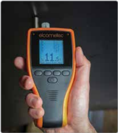
Dustproof and waterproof with fully sealed sensors